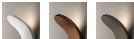
BC Wrinkled white