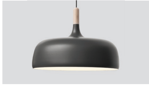
Acorn grey – Item no. 541

Design: Atle Tveit Year: 2012 Type: Pendant lamp