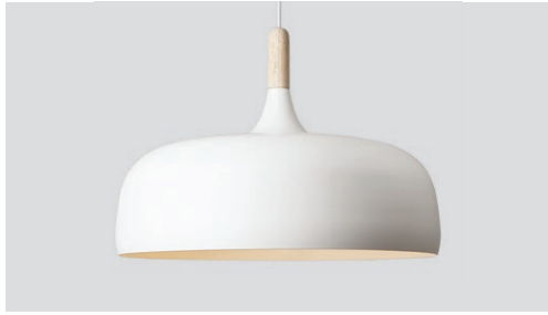
Acorn white – Item no. 540