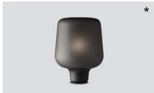
Say My Name table smoked grey matt – Item no. 663