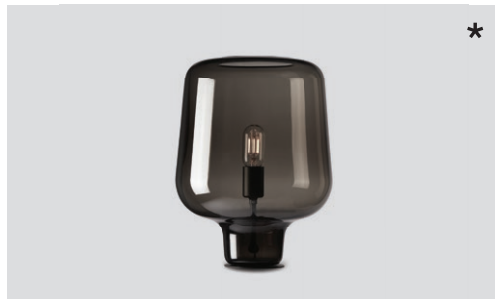
Say My Name table smoked grey glossy – Item no. 662