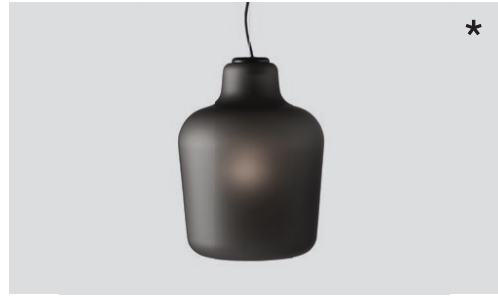
Say My Name pendant smoked grey matt – Item no. 661