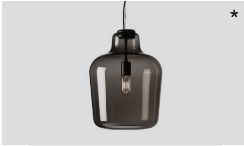
Say My Name pendant smoked grey glossy – Item no. 660