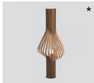
Diva floor smoked oak – Item no. 372