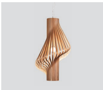
Diva pendant walnut – Item no. 381