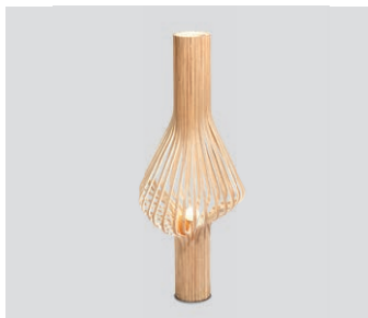
Diva floor oak – Item no. 370