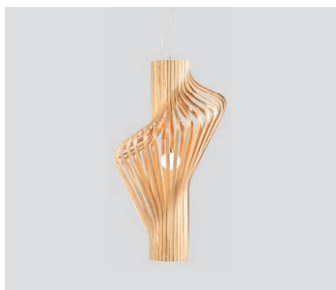
Diva pendant oak – Item no. 380