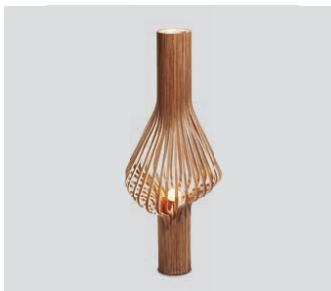
Diva floor walnut – Item no. 371